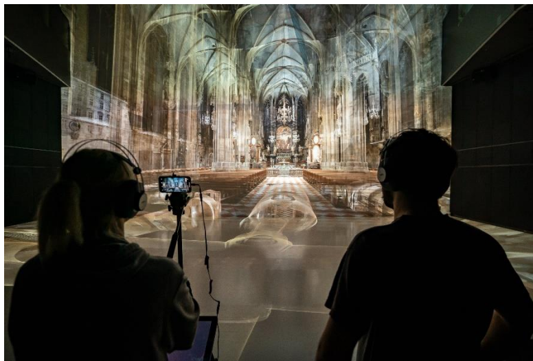
Live Demonstration of The Translucent St. Stephen's Cathedral at Deep Space 8K, Ars Electronica Center

https://ec.europa.eu/programmes/horizon2020/en