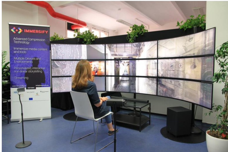
Immersify Final Demonstration viewing at Spin Digital