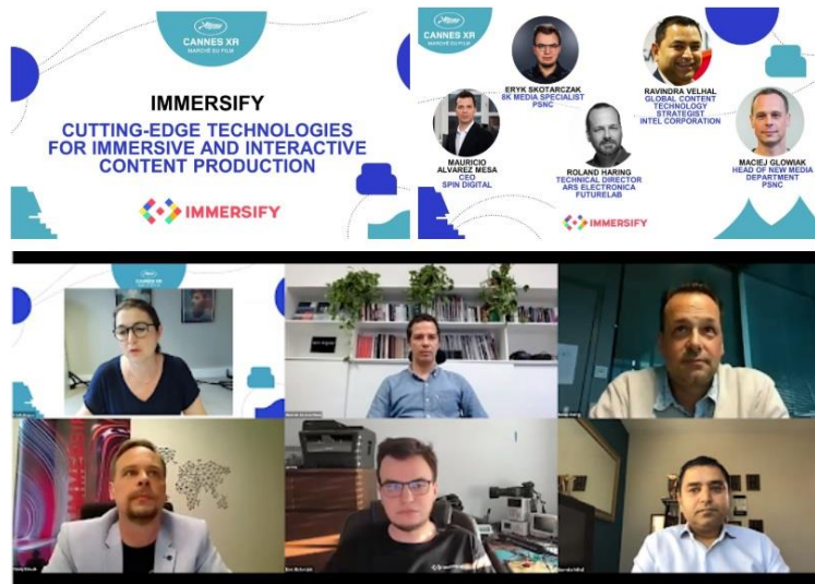
Live Recording of the Immersify Panel at Cannes XR Virtual 2020